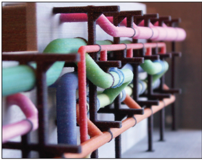
Model of a water plant renovation project in Kaliningrad, Russia