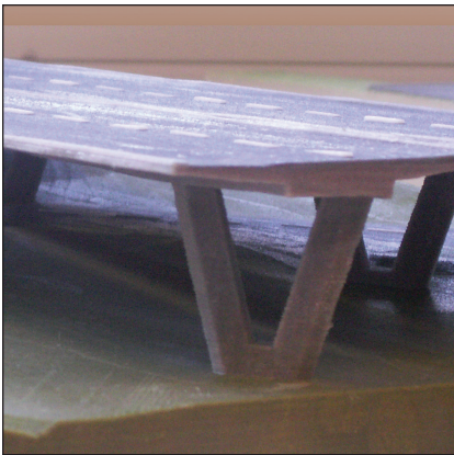
Model of a motorway overpass near Vejle, Denmark

“Architectural designers think in spatial terms, and a 3D model helps bridge the gap between them and the engineers charged with bringing the design to reality. With a physical model, the engineers can see the concept in concrete terms and can easily imagine themselves in the 3D space.”